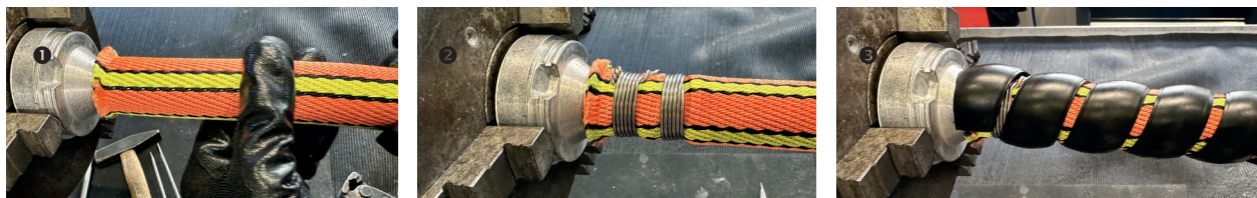
1 Clamp nozzle in the fixture provided + push hose completely onto nozzle. 2 Wind 1.8 mm wire with 2 x 6 turns and a connecting chain between the 2 binding fields. 3 Then pull the plastic anti-kink spiral over the wire band up to the nozzle at the front.