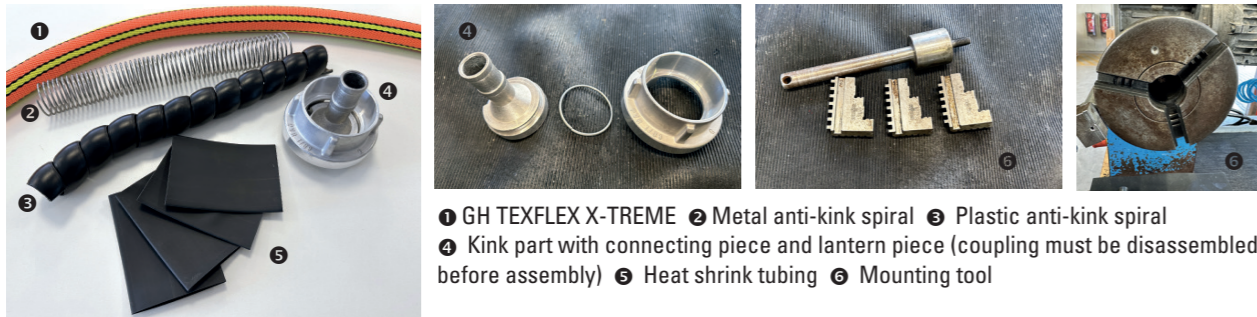
1 GH TEXFLEX X-TREME 2 Metal anti-kink spiral 3 Plastic anti-kink spiral 4 Kink part with connecting piece and lantern piece (coupling must be disassembled before assembly) 5 Heat shrink tubing 6 Mounting tool