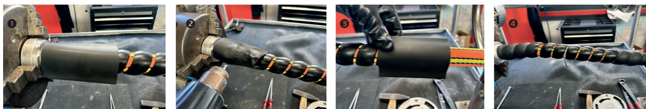
1 Push the shrink tube onto the plastic anti-kink spiral at the front of the nozzle. 2 Use a heat gun (approx. 540°C) to slowly heat the shrink tubing. 3 Place a heat shrink tube in the end area of the plastic kink protection spiral and also heat slowly with the heat gun (approx. 540°C). 4 Final result.