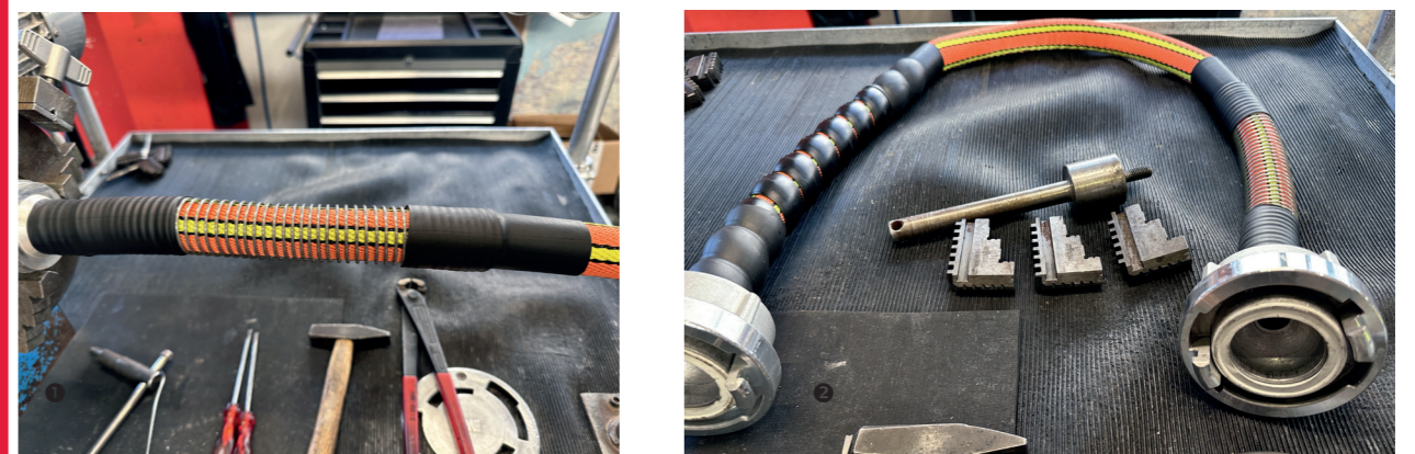
1 Heat shrink tubing must be fused at the spigot at the front of the metal anti-kink spiral and halfway across the end of the metal anti-kink spiral. 2 Ready-bound GH TEXFLEX X-TREME.