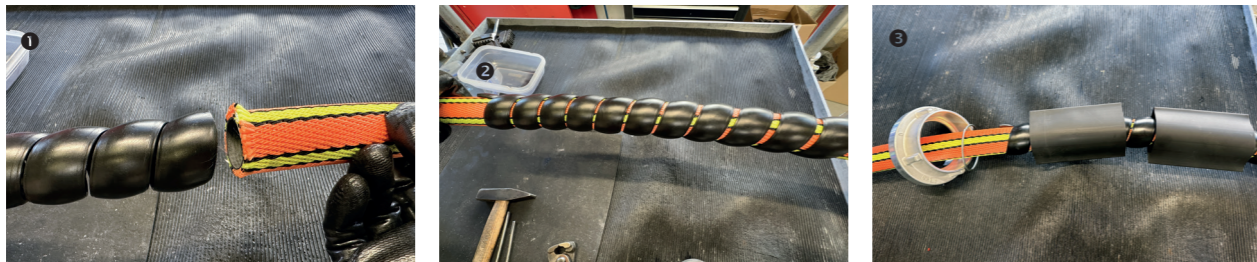
1+2 Pull the plastic anti-kink spiral over the hose - carefully untwist the spiral slightly. 3 Pull locking ring and 2 shrink tubes over the hose.