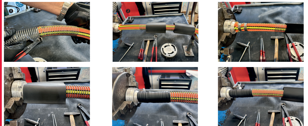
1 Pull the metal anti-kink spiral over the hose, carefully untwisting the spiral slightly. 2 Pull knuckle part, locking ring and 2 shrink tubes over the hose. 3 Wind 1.8 mm wire with 2 x 6 turns, with a connecting chain between the 2 binding fields. 4 Slide the shrink tubing onto the metal anti-kink spiral at the front of the clevis and at the end of the spiral. 5 Slowly heat the shrink tubing with a heat gun (approx. 540°C). 6 Now place a shrink hose in the end area of the metal anti-kink spiral and also heat slowly with the heat gun.